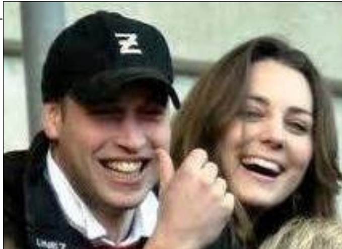
Royal approval: Ashton's plans get the thumbs up from two interested well-wishers.

Its purpose is to help blend vast expanses of roof into the landscape and to slow down water run off in heavy downpours. It consists of a variety of rock type plants which are very shallow rooted and have pretty flowers throughout the summer.