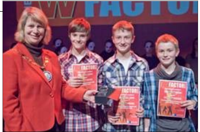
Wow factor: The lads of Maxed Out with their awards.

"Without his involvement, sometimes at the highest level, the job would easily have fallen between the cracks."