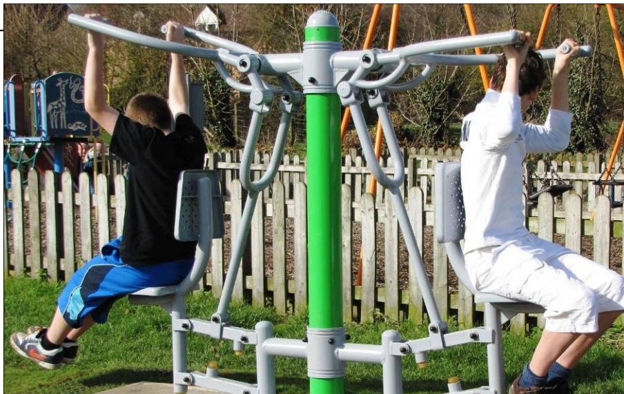
Fit for purpose: New exercise equipment at the playing fields is proving popular with adults and older children, the Community Centre has reported.

If your business is based in the village, you can publicise it by sending details to colin.davison@hotmail.co.uk .