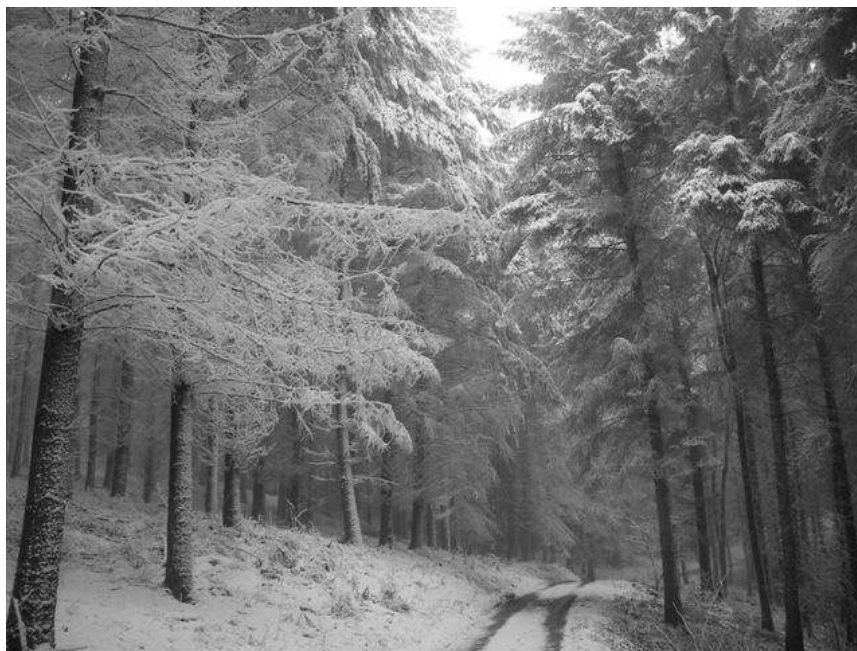
Snowtime: A path through local woodland captured by Russ Cook, one of Ashton's many fine amateur photographers.

have to wait until the summer of 2010 to avoid disruption to middle school traffic.